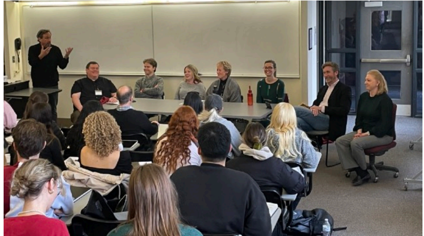
Advisory Board members from all of the SDC programs visit with LA, architecture, and ID students in Professional Practice class.