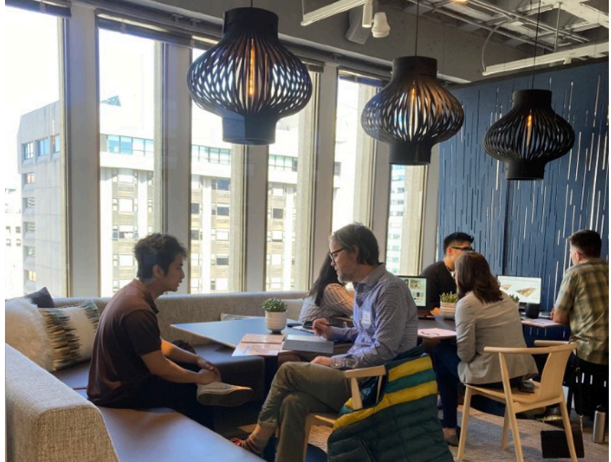
Senior Portfolio Review at Systems Source Showroom in Seattle.

WSU Scholarship for Diversity, Equity and Inclusion in Landscape Architecture