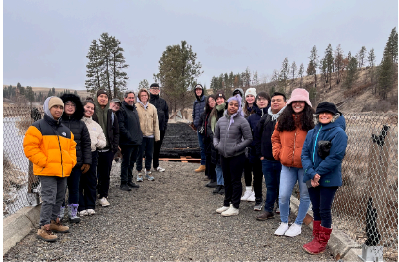
Seniors at a burned bridge in Malden, WA