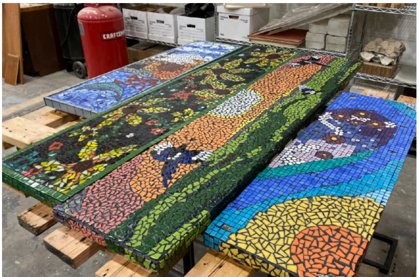
Bench top details.