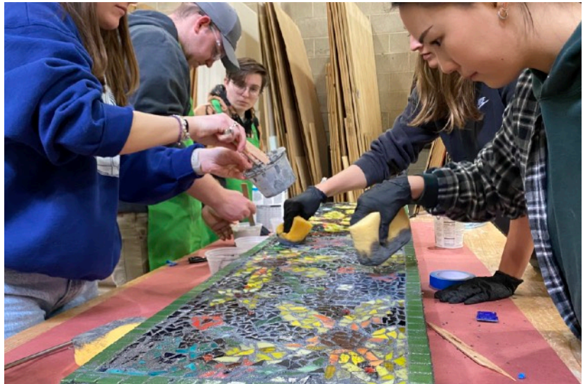
Juniors craft a mosaic bench for the Kelly Ward Memorial