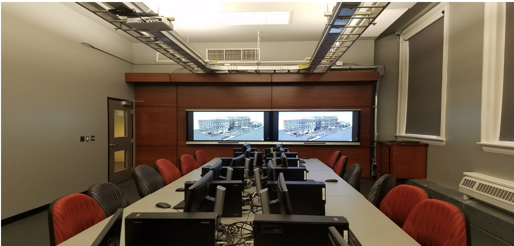
BIM Lab - Phase 1 completed (Fall 2017)