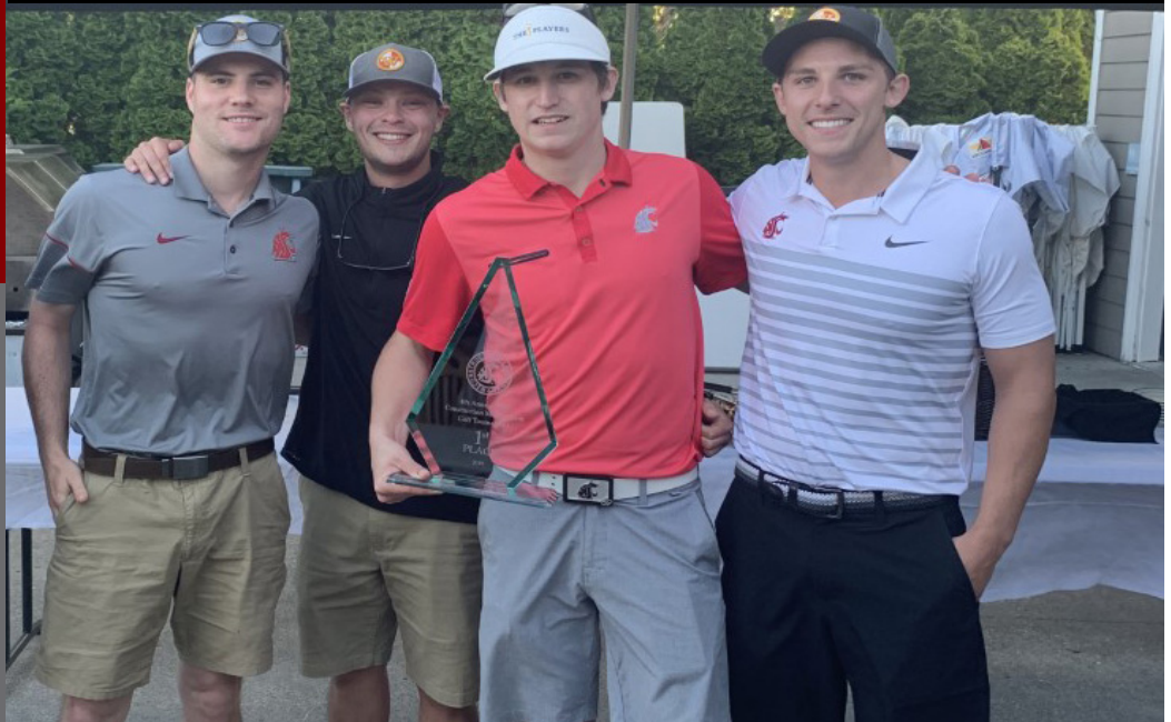
Howard S. Wright team with the 1st place trophy